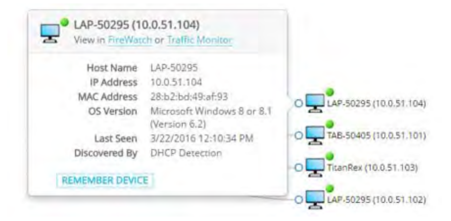
Figure 2. One-click integration with WatchGuard's FireWatch and Traffic Monitor tools

Admins can search and filter all device data to zero in on key areas of interest. They can mark devices as "known" and assign descriptive names. New, unfamiliar devices will immediately stand out when they show up without names.