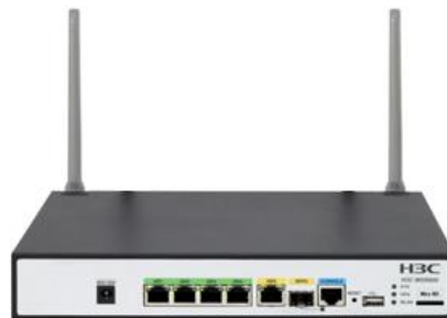
H3C MSR810-LM-GL router

The MSR810 series has the following models: MSR810-LM-GL, MSR810-W-LM-GL, MSR810-LMS-EA, MSR810-10-PoE, and MSR810.