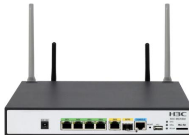
H3C MSR810-W-LM-GL router