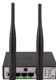
H3C MSR810-LMS-EA router