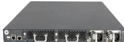
S6800-32Q Rear View