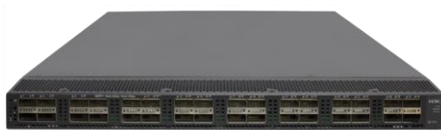
S6800-32Q Front View