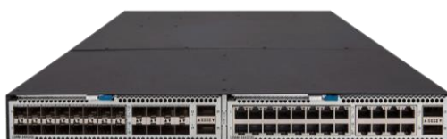
S6800-2C Front View (Module Installed)