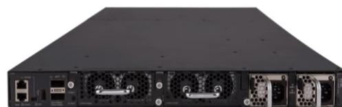
S6800-2C Rear View