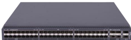
S6800-54QF Front View