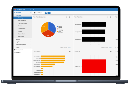
GenAl in FortiManager helps manage networks effortlessly—generate configuration and policy scripts, troubleshoot issues, and execute recommended actions.