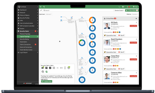
Intuitive easy to use view into the network and endpoint vulnerabilities

Learn more about what's new in FortiOS. <u>https://www.fortinet.com/products/fortigate/fortios</u>