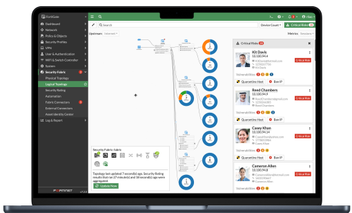
Intuitive easy to use view into the network and endpoint vulnerabilities

Learn more about what's new in FortiOS. <u>https://www.fortinet.com/products/fortigate/fortios</u>